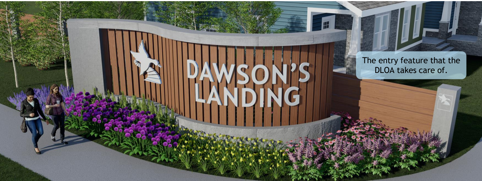
The entry feature that the DLOA takes care of.

Dawson's Landing Owners Association (DLOA) is here to enhance the neighbourhood and foster community growth. DLOA representatives are accessible and happy to answer questions.